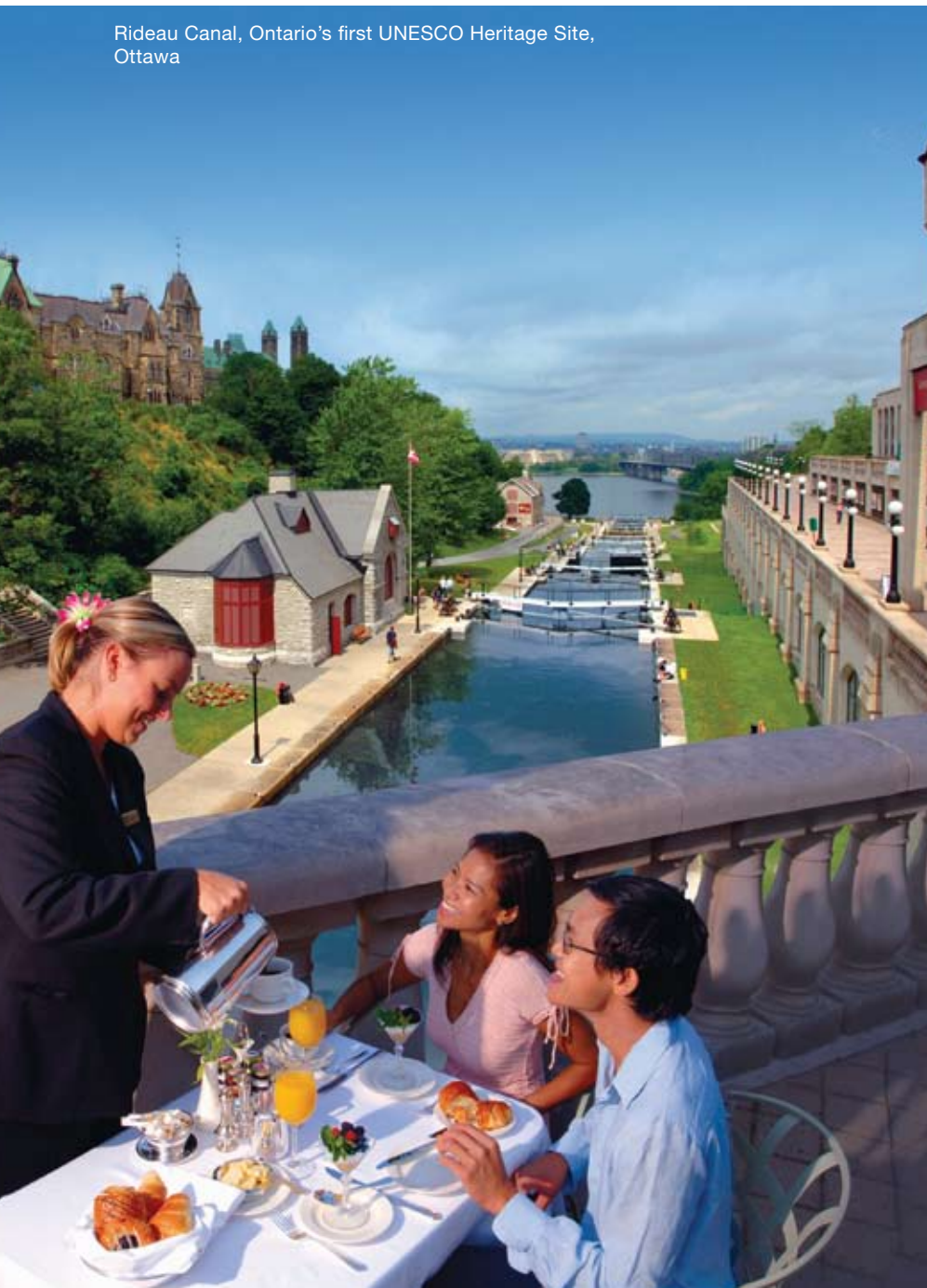
Rideau Canal, Ontario's first UNESCO Heritage Site, Ottawa