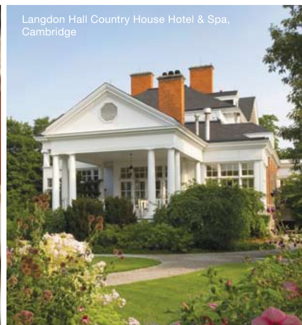
Langdon Hall Country House Hotel & Spa, Cambridge