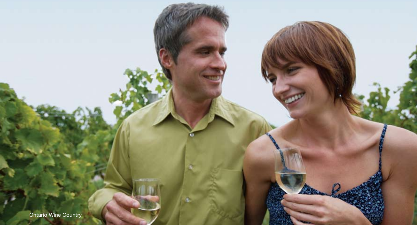
Ontario Wine Country