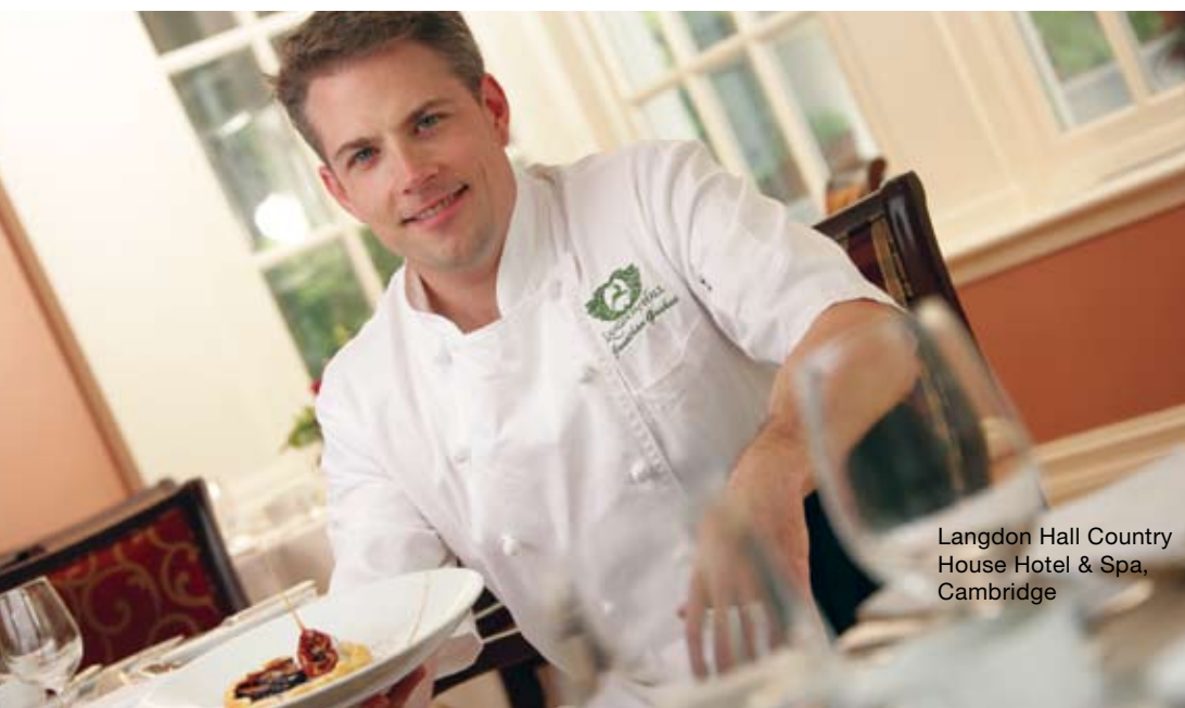
Langdon Hall Country House Hotel & Spa, Cambridge