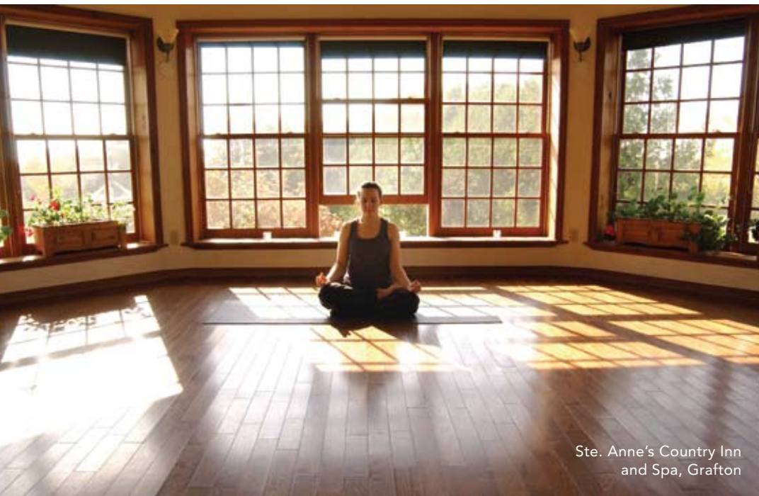
Ste. Anne's Country Inn and Spa, Grafton

Crisp days and long walks make fall the perfect setting to reconnect with those that matter most. So take some time and explore an Ontario made for memories.