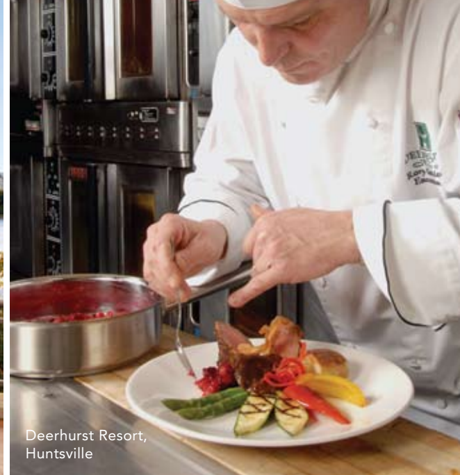
Deerhurst Resort, Huntsville