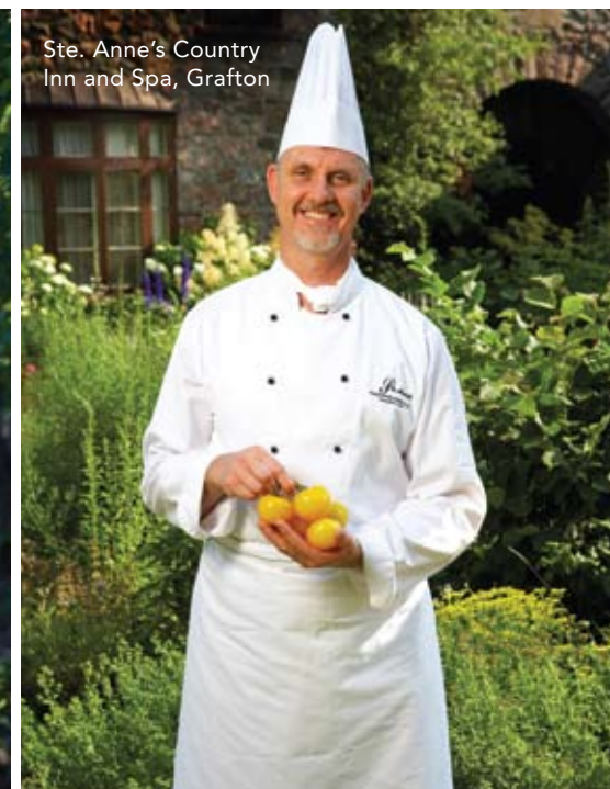
Ste. Anne's Country Inn and Spa, Grafton