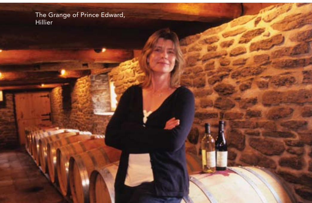
The Grange of Prince Edward, Hillier

Awe at breathtaking hues of gold, auburn and crimson as you hit the open road this fall. With stunning vistas strewn across Ontario, try your hand at nature photography.