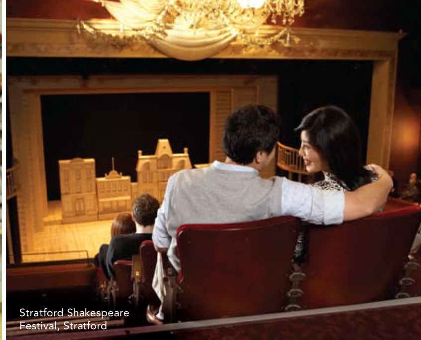
Stratford Shakespeare Festival, Stratford