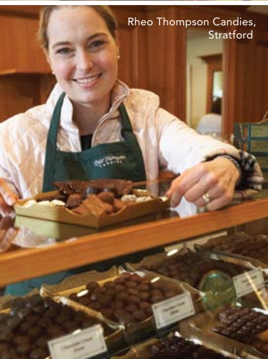
Rheo Thompson Candies, Stratford