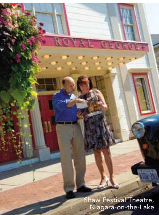
Shaw Festival Theatre, Niagara-on-the-Lake