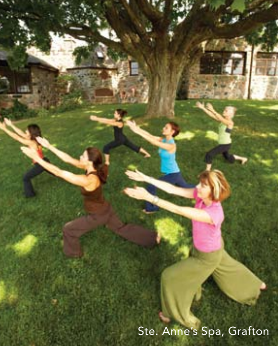
Ste. Anne's Spa, Grafton