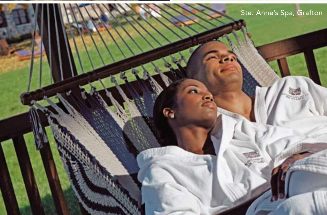
Ste. Anne's Spa, Grafton

Escape to the quaint charm of a small town where an Ontario far from the everyday awaits. Where you can dine al fresco on summer-fresh cuisine then lose yourself to a rousing theatre performance.