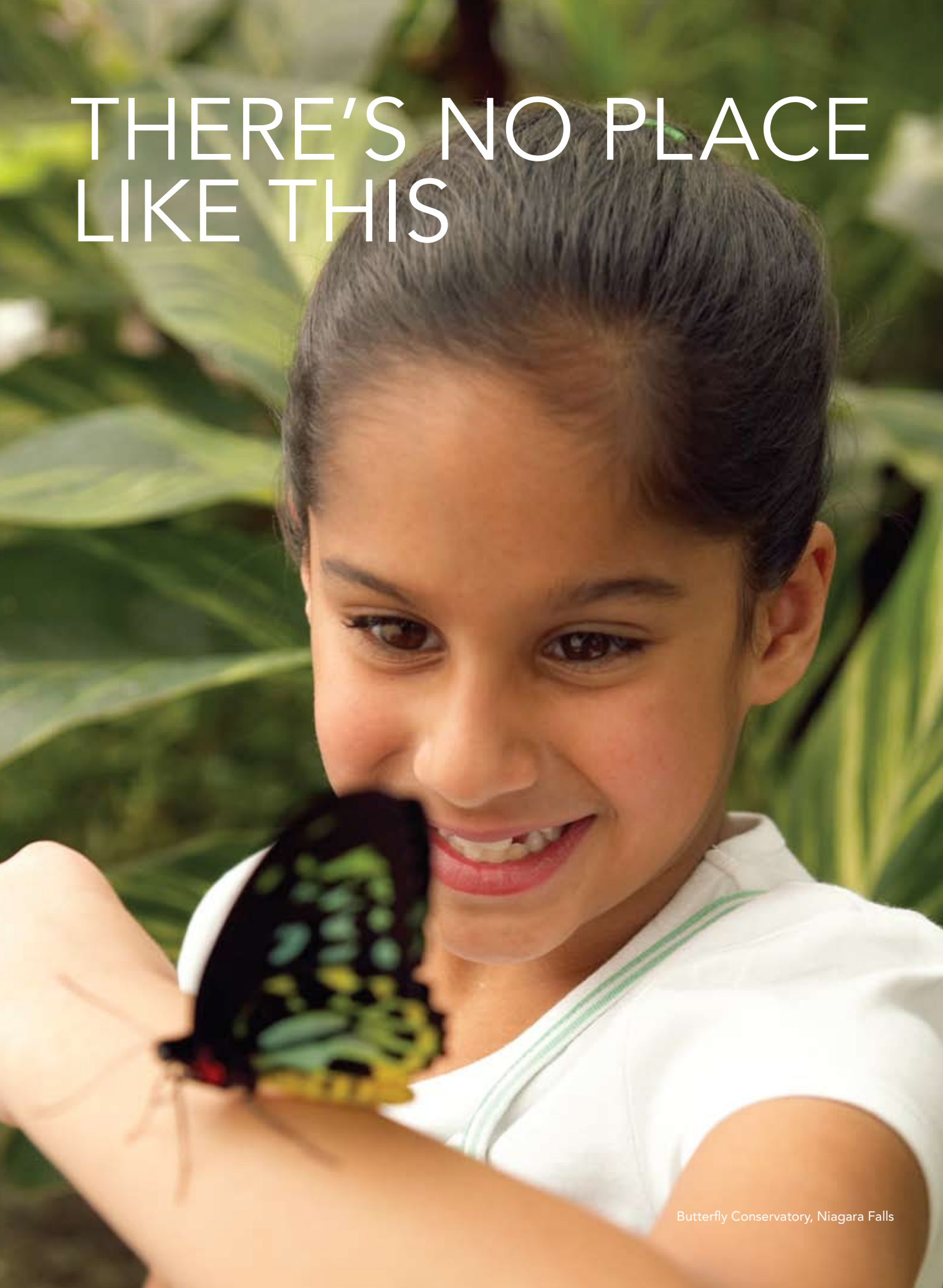
Butterfly Conservatory, Niagara Falls

Excitement waits around every corner, so put on your walking shoes and explore the many city attractions designed for family fun in Ontario this summer.