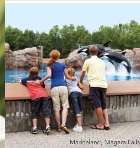
Marineland, Niagara Falls

If you need ideas, or want to see what's happening, use our online Family Fun Calendar.