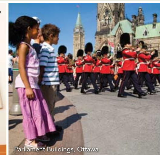
Parliament Buildings, Ottawa