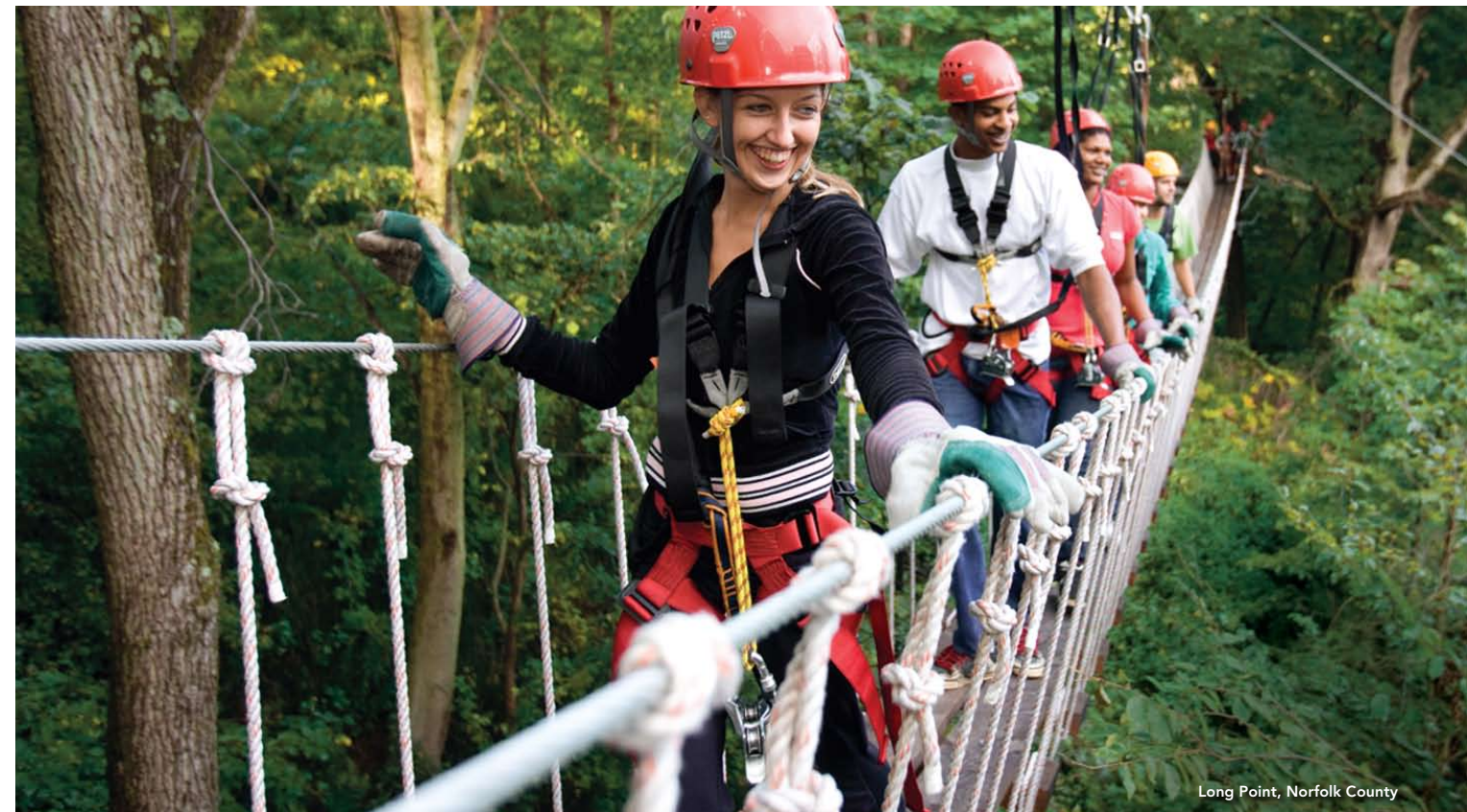
Long Point, Norfolk County

If you find your fun in the great outdoors – then find it in Ontario!