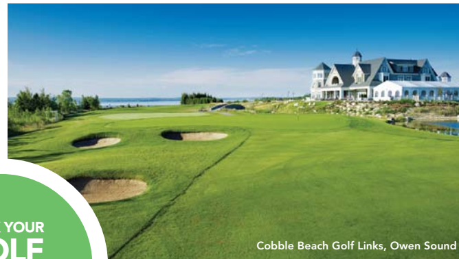
Cobble Beach Golf Links, Owen Sound