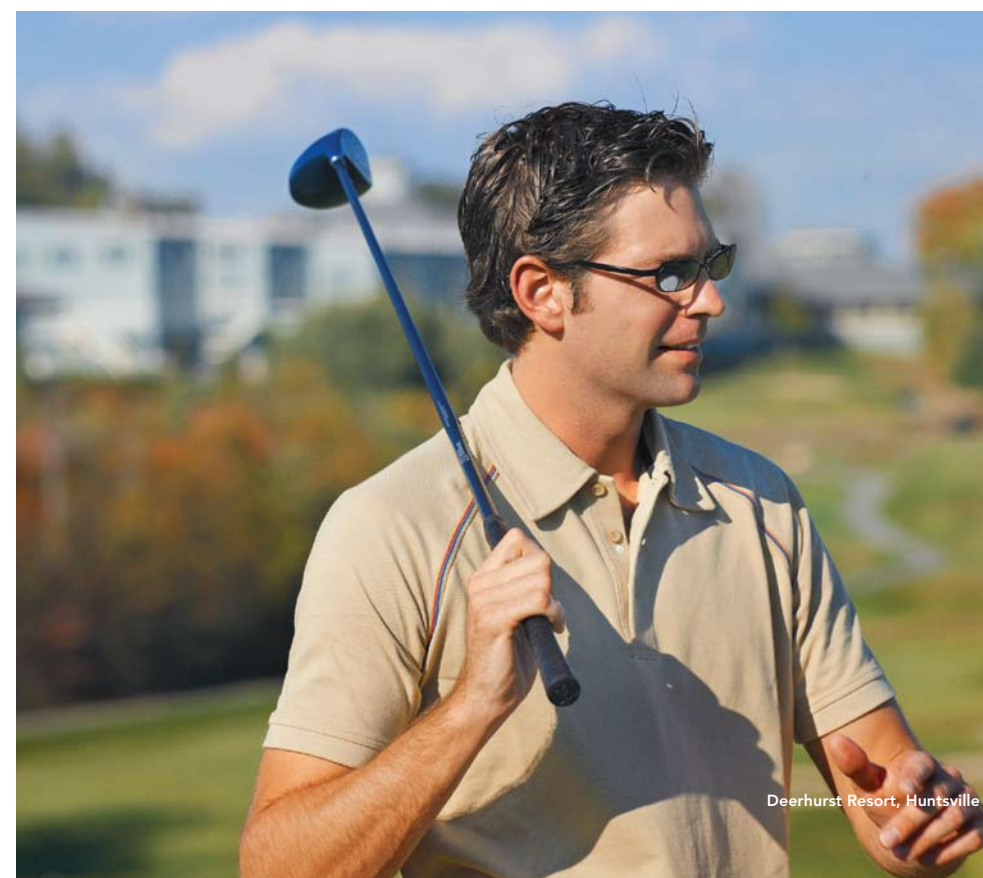
Deerhurst Resort, Huntsville

For more great ideas and packages visit: ontariotravel.net/getaway